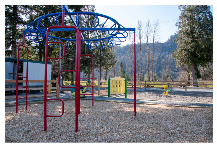
The new play area at the Vedder River Campground.

New vegetation and enhanced site surfacing have been added to enlarged sites to improve the camping experience. The play area and basketball court also received upgrades.