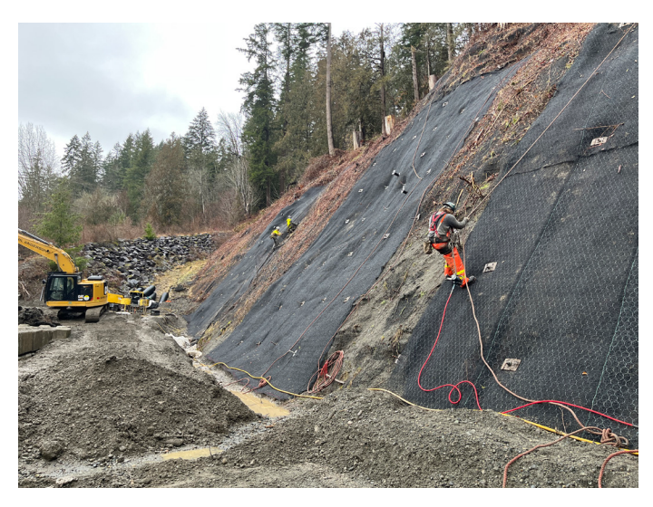
Workers install 950m<sup>2</sup> of geomatting and 24 soil anchors via high-angle rope work, at the Guy Creek Debris Basin engineered slope in the Chilliwack River Valley, Area E.

A $216,000 grant was awarded under the Community Emergency Preparedness Fund–Disaster Risk Reduction-Climate Adaptation Program to complete a Flood