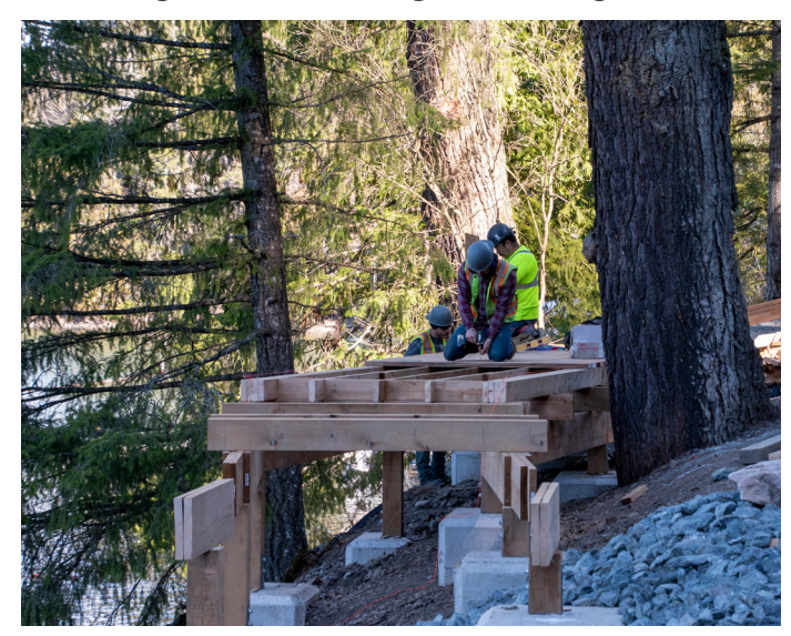
Work continues at the Lakeside Trail in Area H between Sunnyside Campground and Entrance Bay. The segment is anticipated to be completed in April 2023.

In Area D, the boardwalk at the Popkum Community Trail is receiving a facelift including new decking and